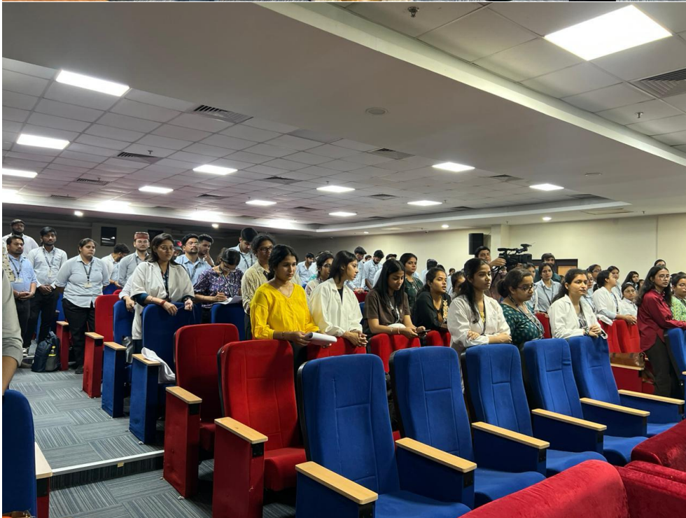
Figure 2: Inugration of the Event